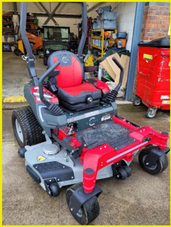
New battery powered mower