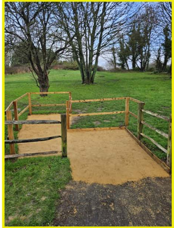
The oval entrance improvements