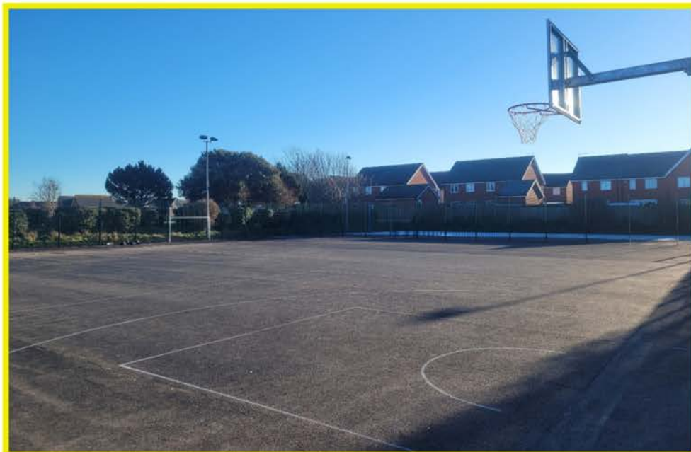
New MUGA Court