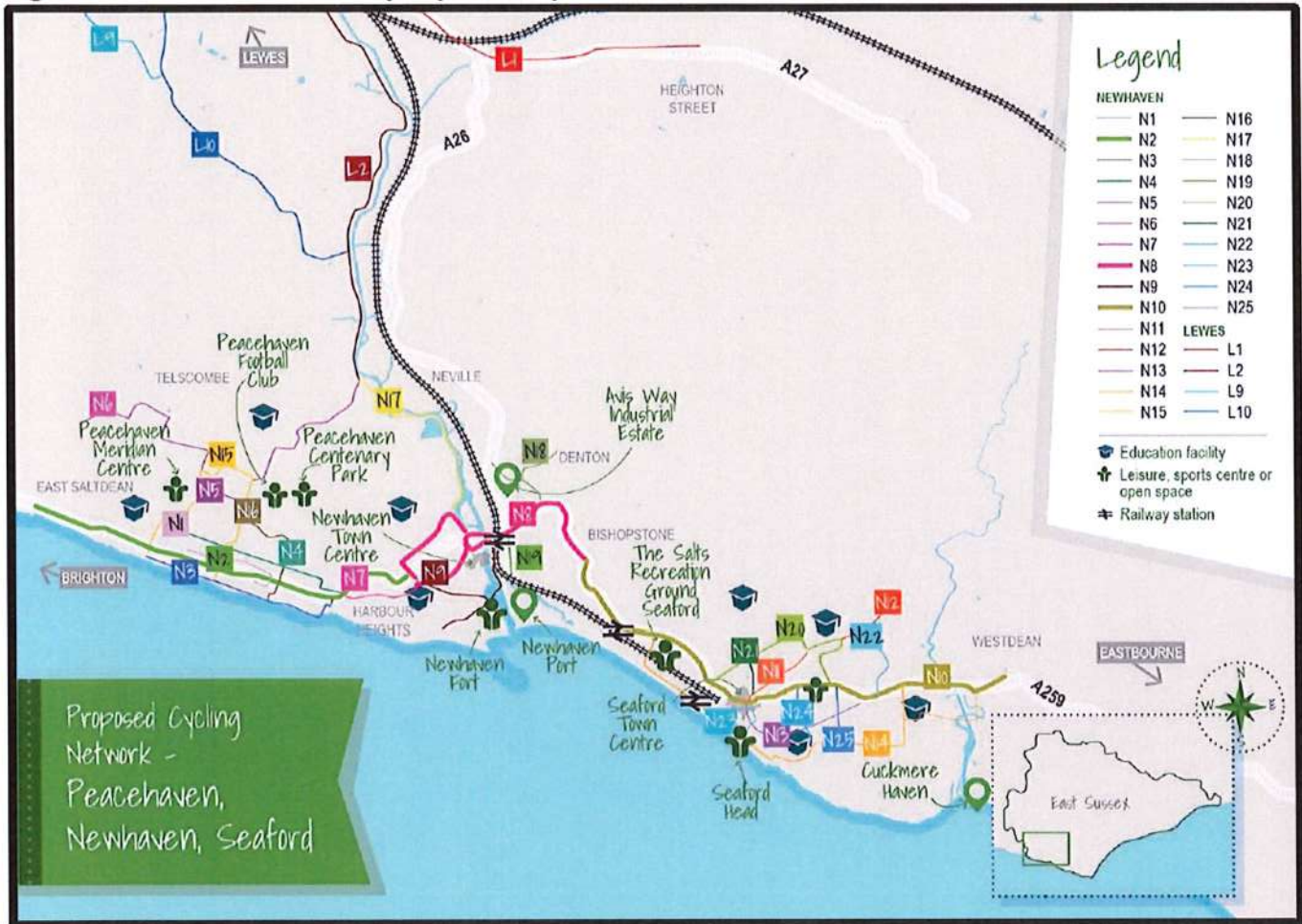
Figure 5 - Newhaven area proposed cycle network