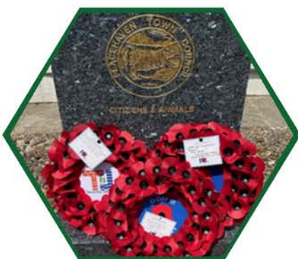
Peacehaven Town Council

Our less formal remit covers the events that the Council puts on for the benefit of the community at large. Most of our events have a zero budget and any profits raised go towards an agreed organisation or charity. This year we have been very busy. Our calendar has covered everything from an Artwave exhibition held last Autumn, to some very successful children's events such as our Halloween party held this year at The Gateway Cafe.