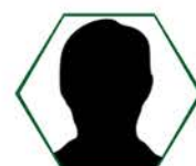
VACANCY West Ward