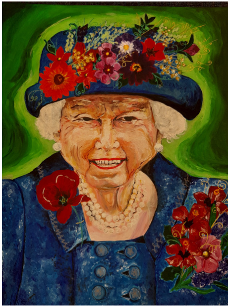
Everyone's a winner