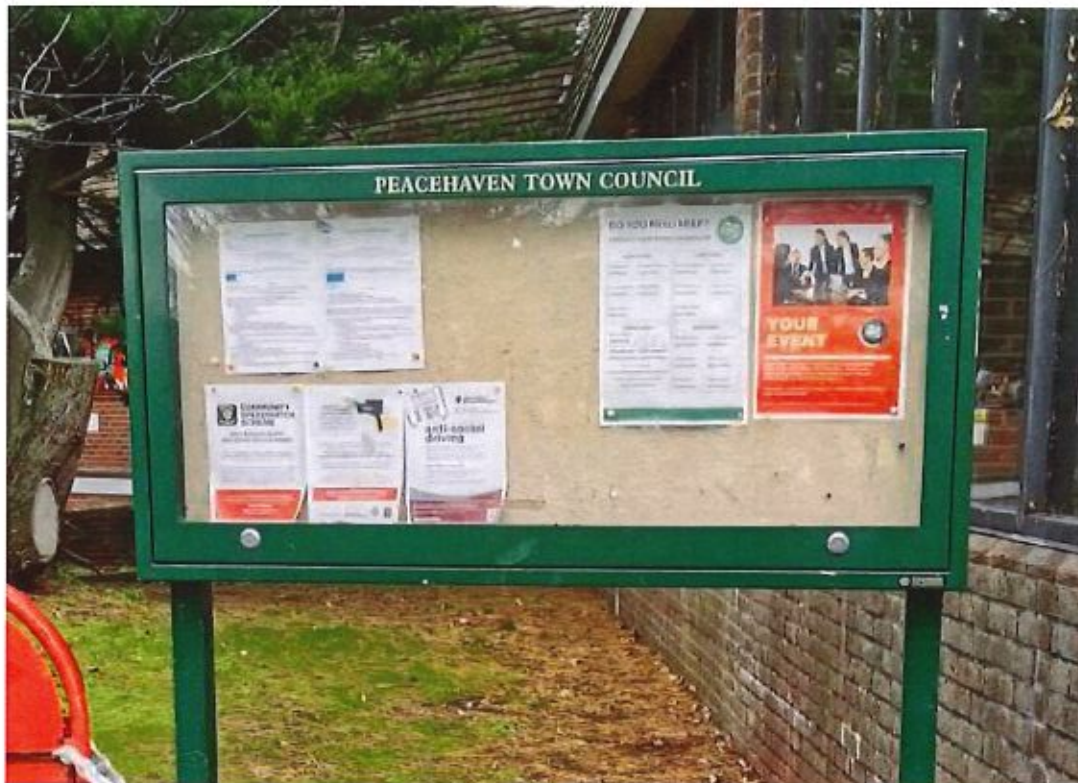
CURRENT METRO SIGNS NOTICE BOARD DESIGN