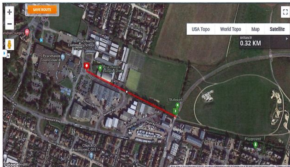
Satellite view of proposed route