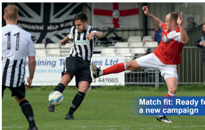
Match fit: Ready for a new campaign

An article in last month's E-News should have made it clear the Great Potato Challenge for schools to grow the largest number of spuds was organised by Peacehaven Horticultural Society and not just one person. The town council apologises for its error and thanks everyone who made the challenge a success.