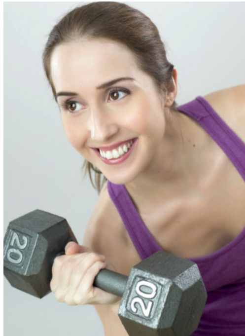
Healthy focus at the summer fair