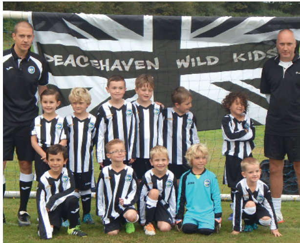
They're the future of football in Peacehaven

Prospective investors can invest as little as £100 to a maximum of £5,000 to buy shares in the club. For each £1 you invest, you will receive one share. So for the minimum £100 investment you will get 100 shares.