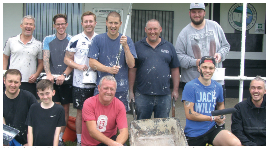
Lick of paint: Players, managers and supporters get ready for the new season

Blood donor sessions are usually held at the Meridian Centre every month.