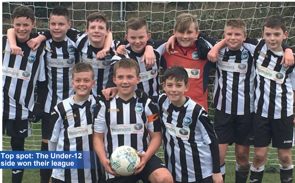
Top spot: The Under-12 side won their league