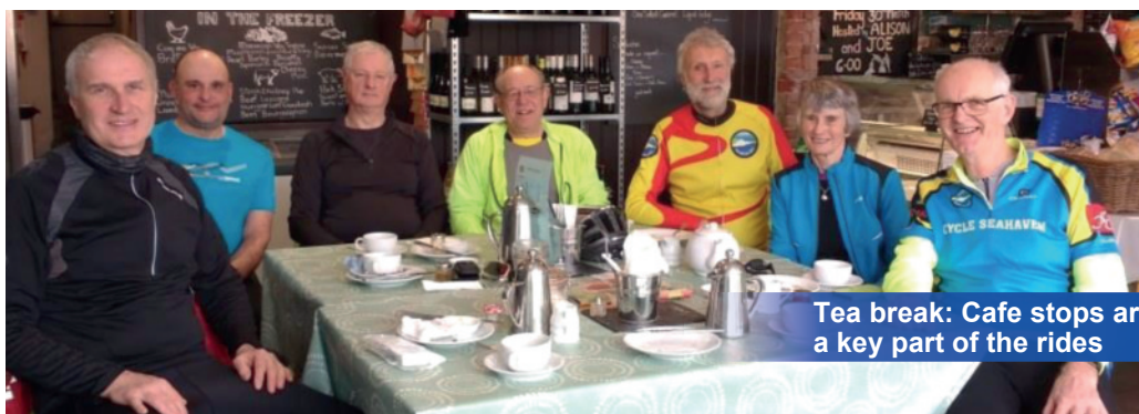
Tea break: Cafe stops are a key part of the rides

Dr Bike does not offer a fully equipped bike repair shop but it has the skills, tools and enthusiasm to carry out basic repairs and maintenance. It can be found at Centenary Park on the third Saturday of each month from 10am to 12.15pm.