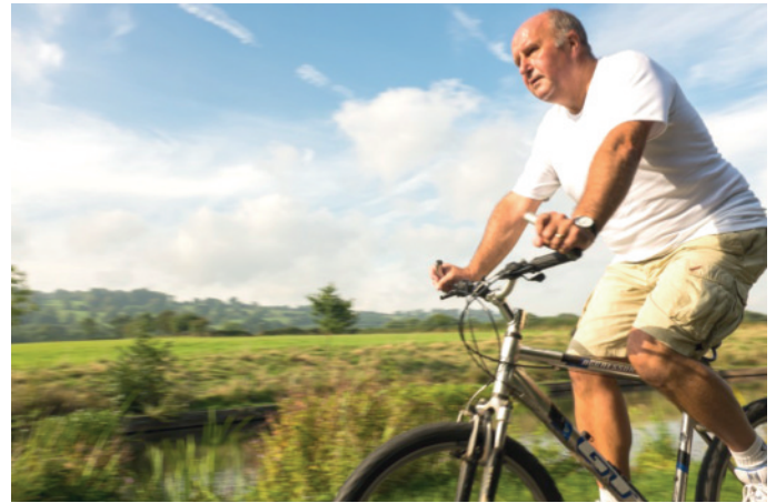
Centenary Park will host a day of events

● To advertise your business or community group on the media screen in the foyer of Community House at the Meridian Centre please contact the Information Office.