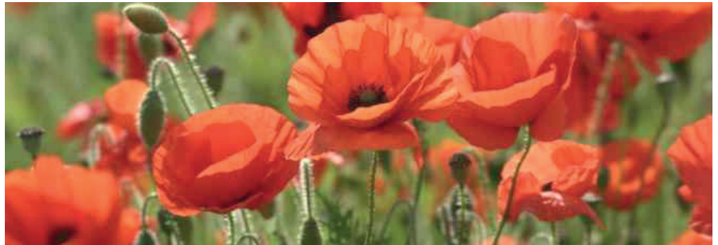
Lest we forget . . . maroons will be fired to mark the two-minute silence

Showing at the town council's cinema at the Meridian Centre on Saturday, November 14, will be Far from the Madding Crowd (12A). Carey Mulligan is Bathsheba Everdene, pursued by three suitors in Victorian England. Tickets are £5 from the Information Office.