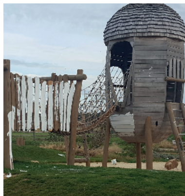
Vandals threw paint around the children's play area