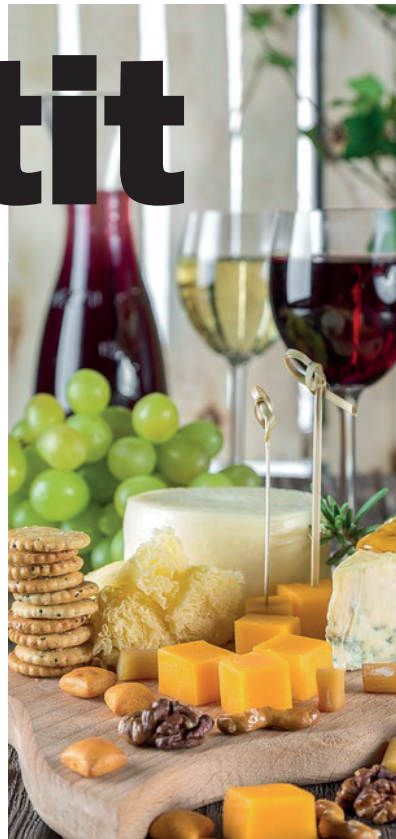
A feast of fine food in the park

To book your place or find out more call 01273 585493 or email deborahadonovan@peacehavencouncil.co.uk