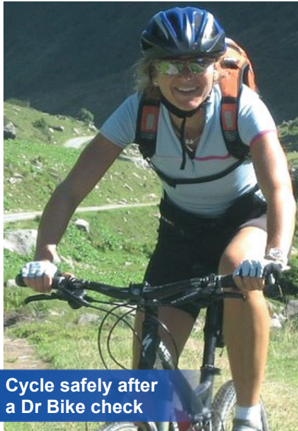
Cycle safely after a Dr Bike check

The council is now working with a cycling organisation called Cycle